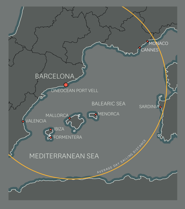
MALLORCA / 95 NM - MENORCA / 110 NM - IBIZA / 135 NM FORMENTERA / 158 NM - VALENCIA / 161 NM - CANNES / 255 NM MONACO / 275 NM - SARDINIA / 312 NM - PORTO CERVO / 330 NM GENOA / 350 NM - PORTOFINO / 360 NM - GIBRALTAR / 525 NM

OneOcean Port Vell is situated in Barcelona's nautical cluster. This includes the Mediterranean's largest refit and repair superyacht shipyard, MB92, and one of the world's leading yacht painting company and major supplier of high-quality marine products, Pinmar. Both of these expert services are conveniently located next to the marina.